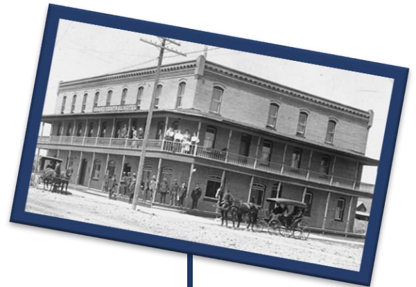
The Royal Duke Boutique Hotel, Eatery & Pub

*Add Grilled Chicken $7, Salmon $10, Steak $13.